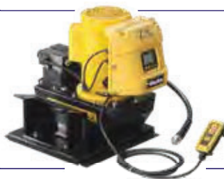
Bench Power Unit 85CE-1PE