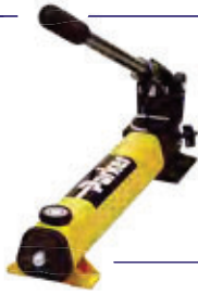
Hand pump 82C-2HP

For use with Karrykrimp 1 crimping press