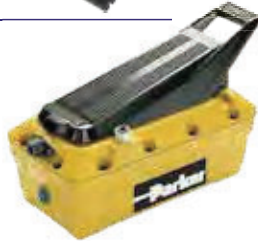
Turbo air pump 85C-0AP