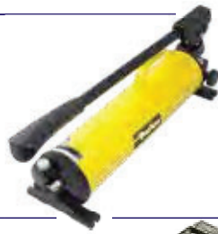
Hand pump 85CE-0HP

For use with KarryKrimp 1 and KarryKrimp 2 crimping presses