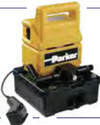
Power pump 82CE-0EP