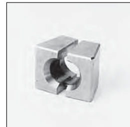
Fig. R71 — Flaring Die Set

Dimensions and pressures for reference only, subject to change.